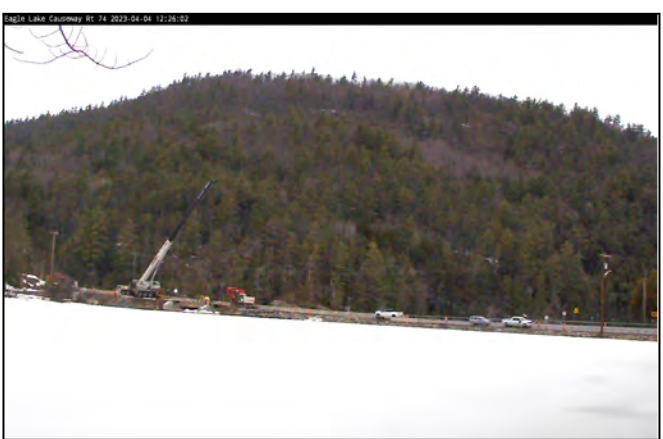
The link for the causeway camera is below:

http://eaglelake1.org/html/video/cameras/viewer.php?CameraSelected=Bridge+Replacement+Camera&St artDate=2023-04-04&EndDate=2023-04-04&StartTime=00%3A00&EndTime=23%3A59&DayNight=D AY&speed=240&delay=1000&Direction=FORWARDS&submit=APPLY+CHANGES